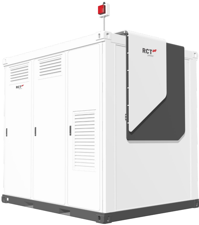
POWER CESS 1000 US SERIES