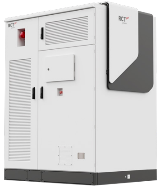
POWER CESS 200 US